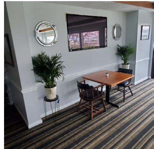
Pictured Above: Scenes from our fresh new CQ with new paint, LED lights, live plants and a resurfaced bar!